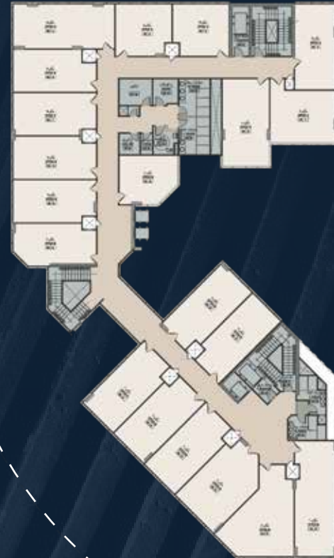
Sixth Floor Plan