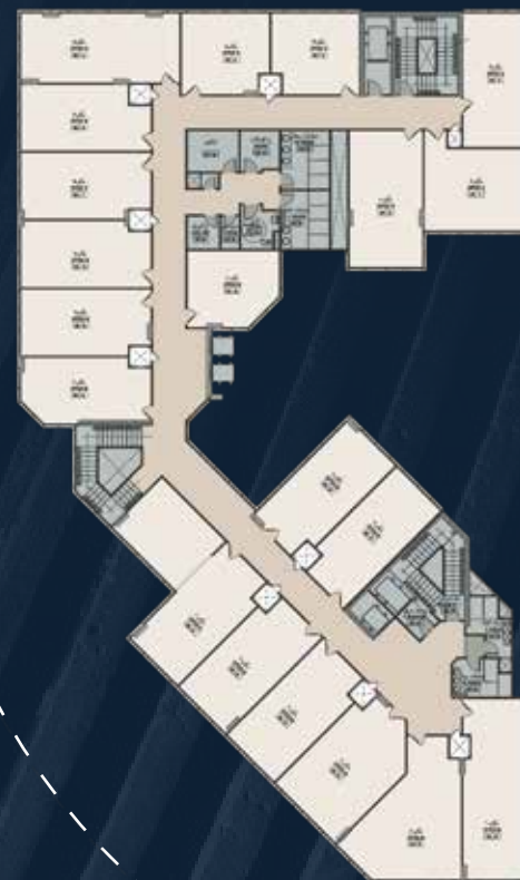
Eighth Floor Plan