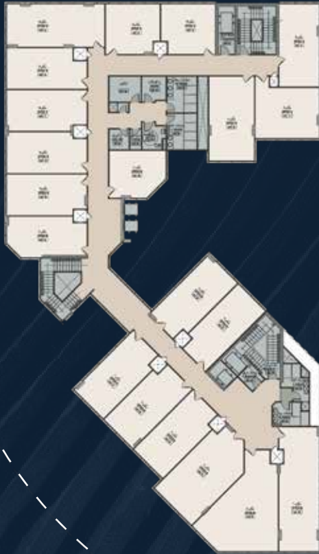
Third Floor Plan