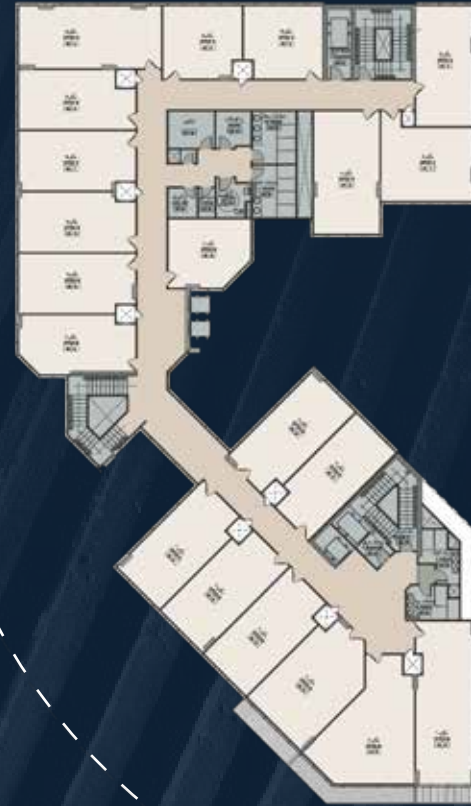
Fourth Floor Plan