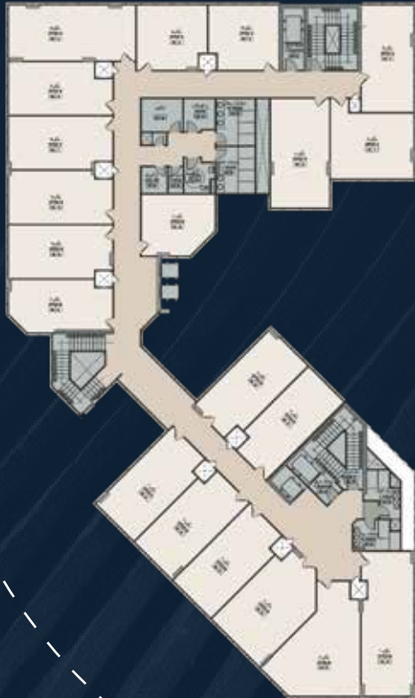
Fifth Floor Plan